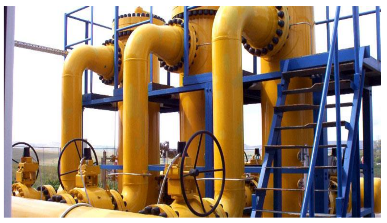
Disclaimer : The content of this publication is the exclusive responsibility of SNTGN Transgaz SA and does not necessarily reflect the opinion of the European Union.

( Reference number in the second list of PCIs: 6.15 )